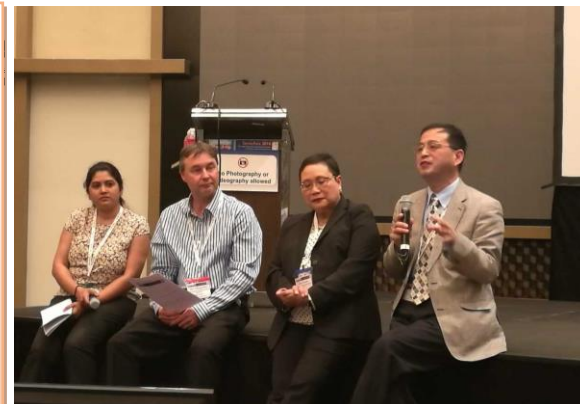
FOP WORKSHOP Q&A SESSION